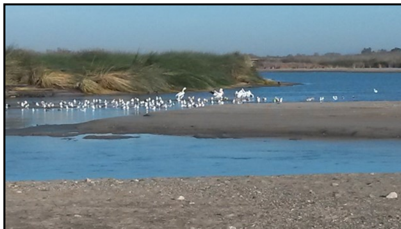
Santa Clara River Estuary

The City of Ventura and stakeholders met over a couple of years to determine how to adjust the tertiary treated water that Ventura Water should divert for reuse and how much discharge (if any) is needed to benefit the estuary and protect its native species. Wildlife interests voiced that a reduction in discharge is not always adverse for every species as assumed. For example, many migratory birds use the estuary when mudflats form during low water conditions. In addition, if sandbars increased or formed they may become good nesting habitat for species such as snowy plovers. The resulting management plan will be adaptable to ensure there are no negative impacts to sensitive species.