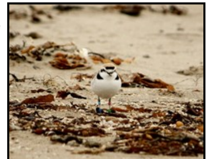
Snowy plover

Threats to natural coastal areas include increased erosion, higher tidal inundation and flooding, reduced sediment (sand) supply, and increased pressure from human development and recreational activities on coasts. Debra participated on a natural resource specialists' team who selected the most vulnerable species for beaches, dunes, freshwater and estuarine habitats. A long-time favorite of VAS, the snowy plover, was chosen for dunes. Keeping an eye on these indicators will help the County develop adaptation strategies to affect future policies and ordinances to deal with SLR.