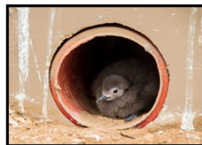
Cassin's Auklet Todos Santos, 2016

The presentation will highlight restoration efforts for seabirds on the Channel Islands and Baja California Pacific Islands, including invasive species removal, habitat restoration, and social attraction. The Western Gull chicks seen here (left), the Scripps Murrelet, and Cassin's Auklet are some of the bird species we'll discuss.