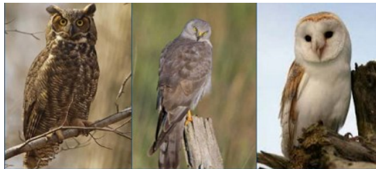
Figure 8. Great Horned Owl, Northern Harrier, Barn Owl