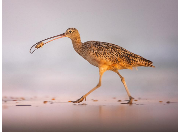
Long billed curlew

We will walk along the beach from Surfers Knoll parking lot to the estuary. We will hope to see a variety of shorebirds including Snowy Plovers, Ruddy and Black Turnstones and hopefully Surfbirds which are always an exciting treat. We will also tackle some gull and tern identification, so bring your field guides!