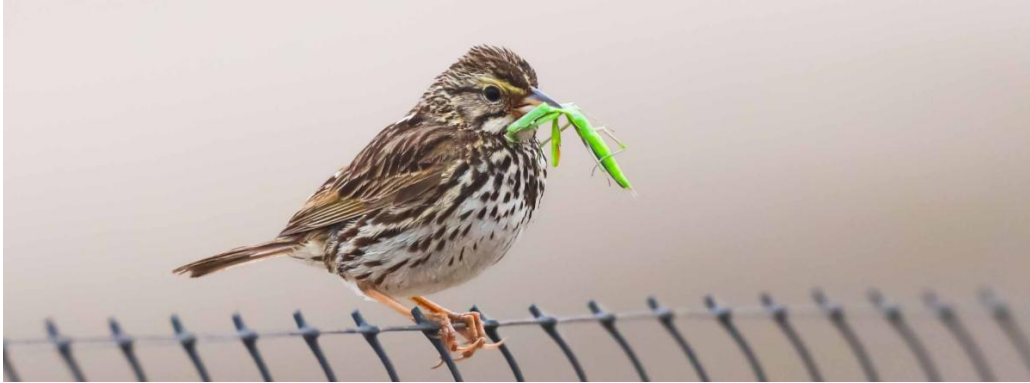
Savannah Sparrow at Ormond Beach

Ventura Audubon Society March 2024 Volume 65, Number 7 A Chapter of the National Audubon Society venturaaudubon.org