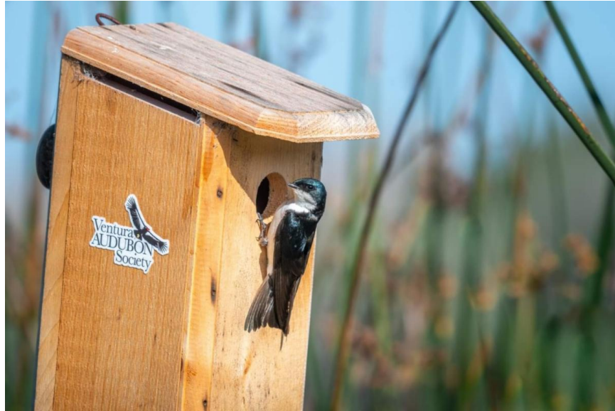
Tree Swallow at Ventura Settling Ponds in 2022

On February 23rd Ventura Audubon volunteers installed 6 new nest boxes at the Ventura settling ponds. The new boxes are especially suited to tree swallows and have been carefully positioned to favor nesting success. We hope to attract tree swallows to establish nests and raise their young this coming spring.