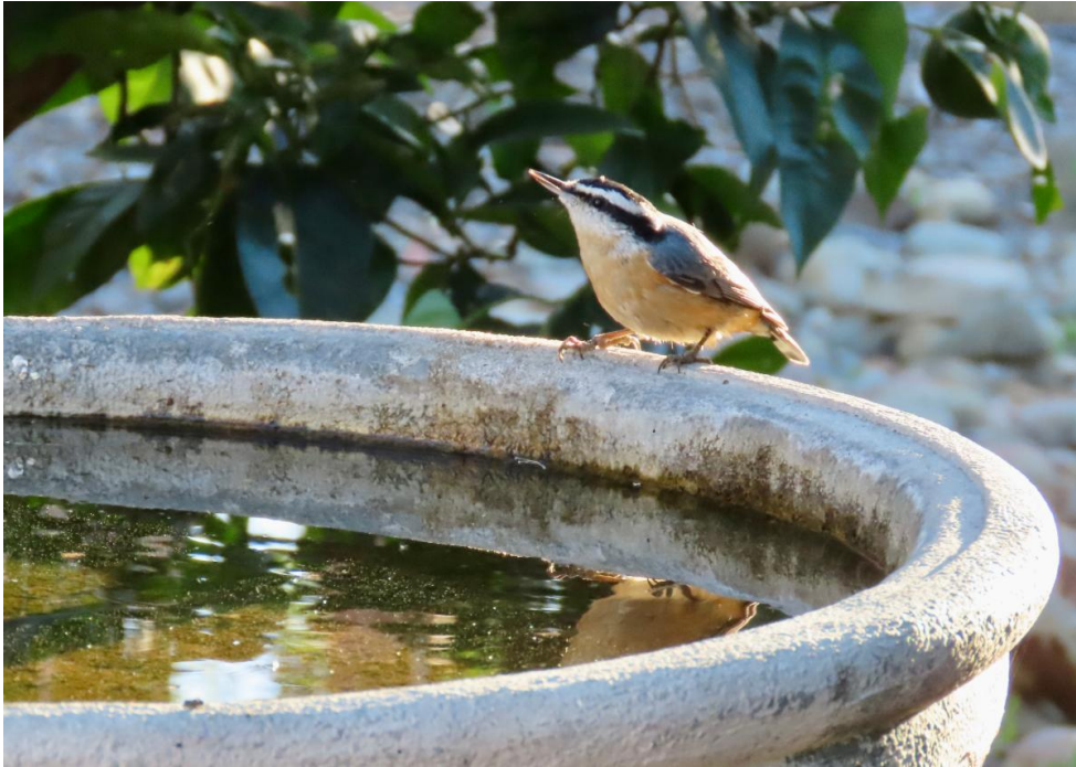
Red Breasted Nuthatch: Photo by Chuck Engel

Ventura Audubon Society November 2023 Volume 65, Number 3 A Chapter of the National Audubon Society venturaaudubon.org