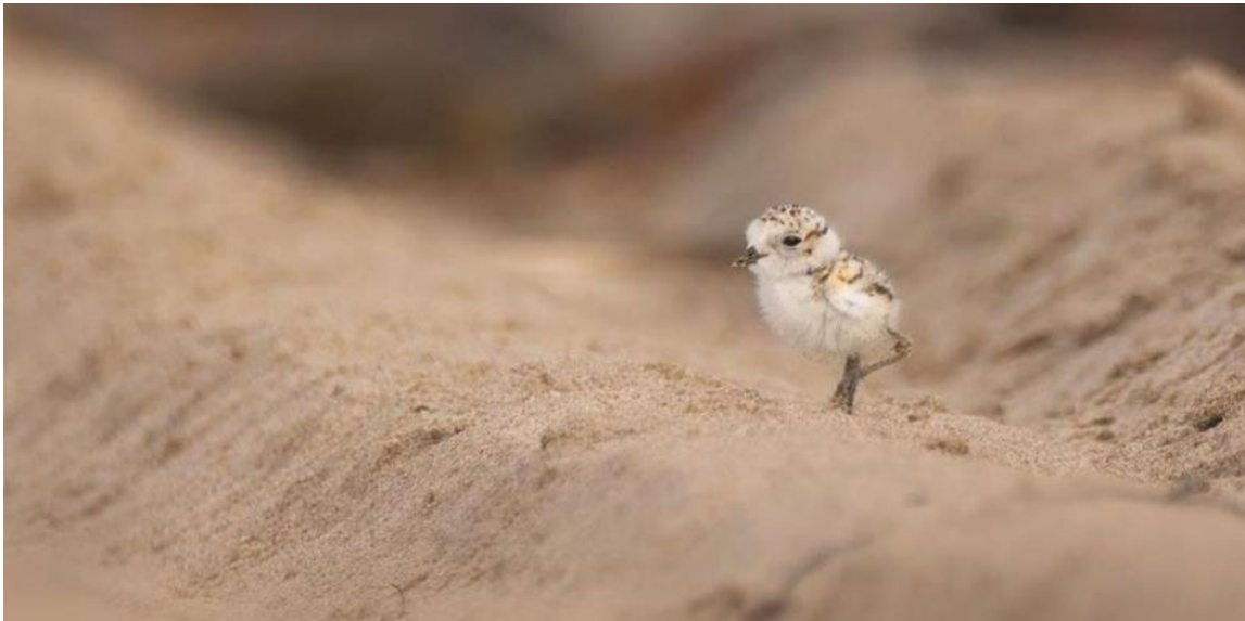
Snowy plover chick