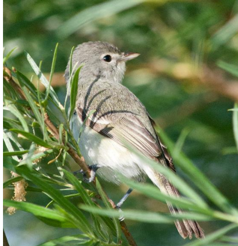
Least Bell's Vireo

This program will cover background information about the history of Channelkeeper's involvement in the Ventura River watershed including events that led to Channelkeeper's litigation against the State Water Board and City of Ventura to address over-pumping.