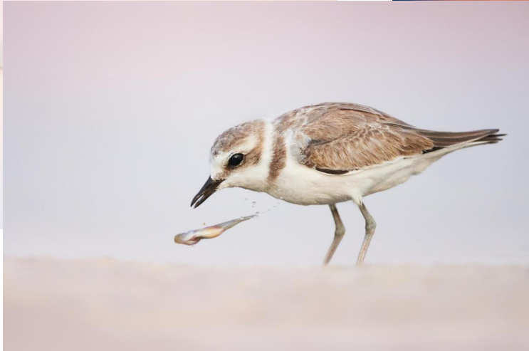
Kentish plover, catching a fish!