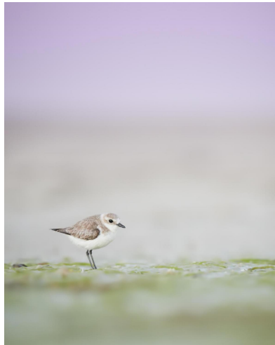
Lesser Sand Plover